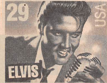
□ Elvis fans filled the Zebulon post office Friday to buy his stamp

This past Friday, on what would have been Elvis' 58th birthday, it