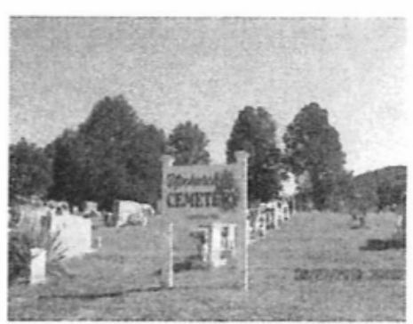
Cemetery Photo

Created by: <u>lyndon baines</u> Record added: Apr 28, 2011 Find A Grave Memorial# 69055500