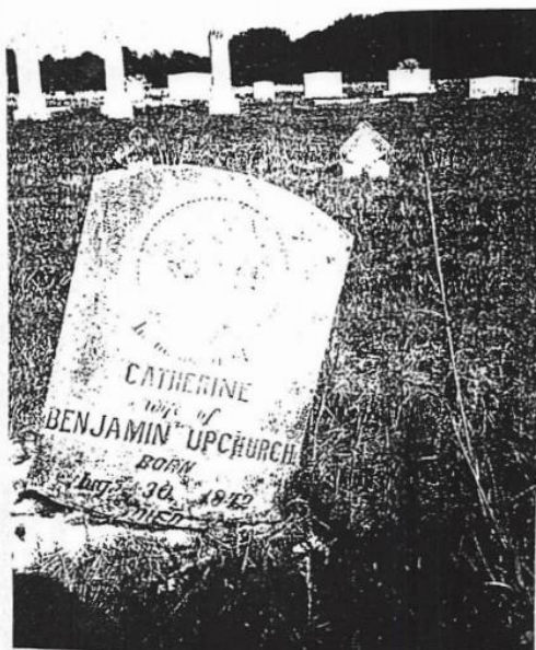
2 nd wife of Benjamin ↑ Stone Broken - death of death

Broken off [NEILL'S CREEK CEM. HARNETT CO NC]