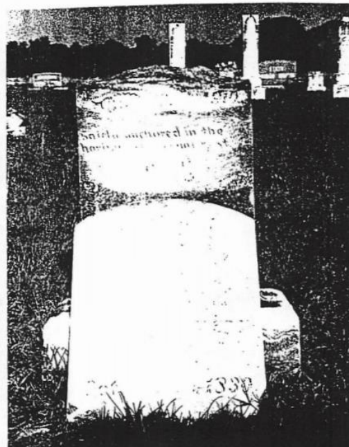
Benjamin UA - Stone Broken

Broken off [NEILL'S CREEK CEM. HARNETT CO NC]