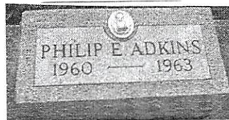
Added by: clio

Burial: Hazelwood Cemetery Grinnell Poweshiek County Iowa, USA