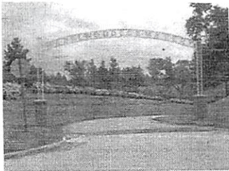
Cemetery Photo

Add a photo for this person Request A Photo