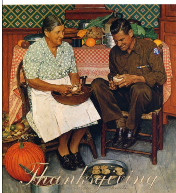
Thanksgiving —mother and son peeling potatoes—1945

If you have the privilege of speaking with older relatives this holiday season, please consider some suggestions: 1) Write down family stories so they are not lost. 2) Record your thoughts and experiences for future generations. 3) Interview a relative or grandparent via phone, FaceTime or Skype. Lastly, visit your local library to see what digital or web genealogy offerings they have available. If you are not connected to Ancestry, there is a very good chance your library is! Lastly , dial in to our American Upchurch Index Tree on Ancestry!