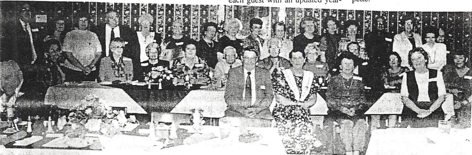
Wakelon class of 1952 reunion attendees