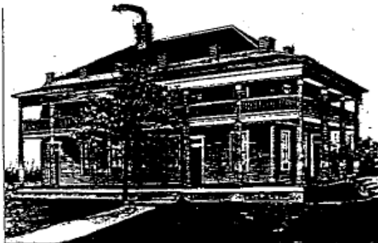
BERACHAH INDUSTRIAL HOME.