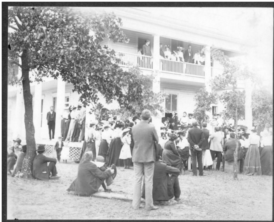
Berachah Home dedication service – people standing on lawn looking toward front porch, May 14, 1903. The label on the image reads: "No. 3. Berachah Industrial Home for Redemption and Protection of Erring Girls. Taken during the dedication service, conducted by the Superintendent. The picture only shows a small part of the crowd present and was taken, May 14th, 1903. after the speaker had been addressing the congregation for nearly an hour."

Today the property is on the campus of the University of Texas at Arlington and the only physical reminder of the history of the site is the cemetery opened in 1904 that contains over eighty graves of unwed mothers, stillborn babies, children who died in measles epidemics, and employees and their children.