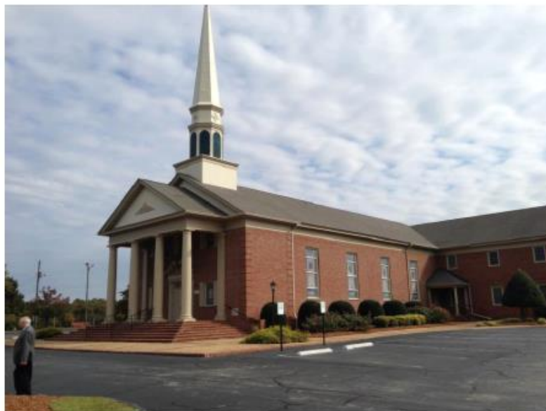
Pictured above is the Neills Creek Baptist Church of Harnett County, NC as it was found on October 13, 2015.