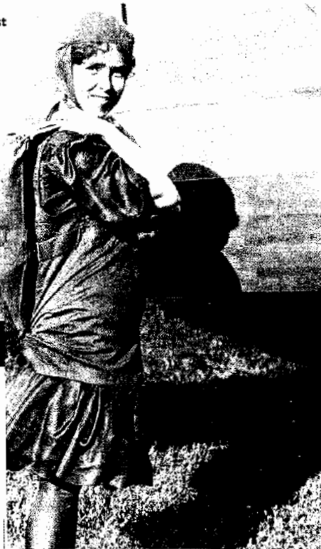
Georgia Broadwick, the first woman to parachute from an airplane, was a spunky Tar Heel, too.