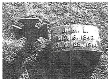
Added by: Armantia