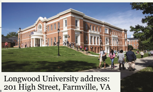
Longwood University address: 201 High Street, Farmville, VA