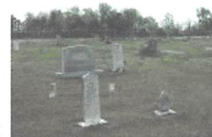
Click photo to enlarge