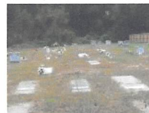
Click photo to enlarge