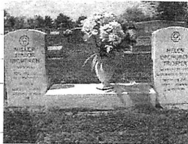
Added by: B. Meales