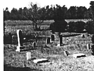
Click photo to enlarge