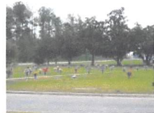
Click photo to enlarge