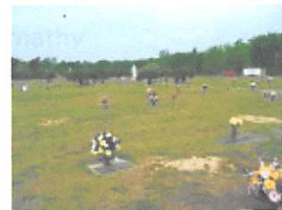
Click photo to enlarge