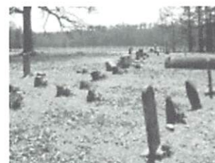
Click photo to enlarge

From the intersection of U.S. Hwy. 40 and Hwy. #70, on the east side of Raleigh, at Exit # 306-A, take Hwy. #70 southeast for 6.1 miles to the traffic light at Shotwell Rd. (SR # 1553), Clayton, Johnston Co. Turn north onto Shotwell Road, (which will become Mial Plantation Road. (SR #2509) after re-entering Wake Co.) It is 3.5 miles from Hwy #70 to the cemetery located on the west side of Mial Plantation Rd., about 1/4 mile after crossing over the Neuse River.