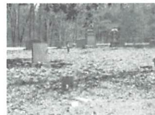
Click photo to enlarge

The cemetery is neat and well kept, with space for more burials. Parking is available. The cemetery contains about 1.6 acres and is the property of Tippetts Chapel Free Will Baptist Church, located 1 mile south of the cemetery at 2500 Shotwell Rd., Clayton, NC, 27520, ph.919-553-7037.