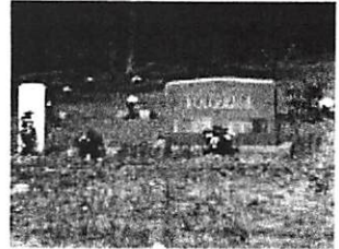
Click photo to enlarge