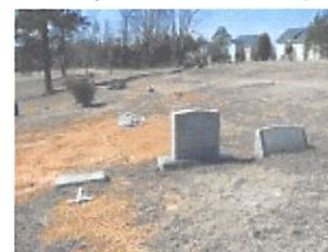
Click photo to enlarge