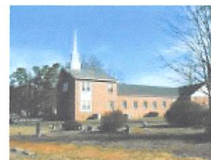
Click photo to enlarge