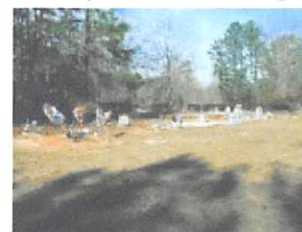
Click photo to enlarge