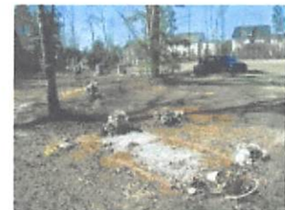
Click photo to enlarge

From the beltline (Hwy. 440, US 1, and Hwy.64 W) head west to the Apex (Hwy. 55) exit on US 1, (Williams St). Turn left at the light, going towards Holly Springs and Fuquay-Varina. Go about 2 1/2 miles to a light and a left turn on to Holly Springs Rd. (SR 1152). About 1 1/2 miles up the road turn right onto Sunset Lake Rd., (SR 1301) and go about 1/2 mile to a cemetery on the right side of the road just past the entrance to Sunset Ridge Subdivision, Kenmont Dr.