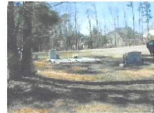
Click photo to enlarge

From there a track leads to this cemetery which is well back from the road, behind the ( Jones, Booker ) cemetery which is up front.