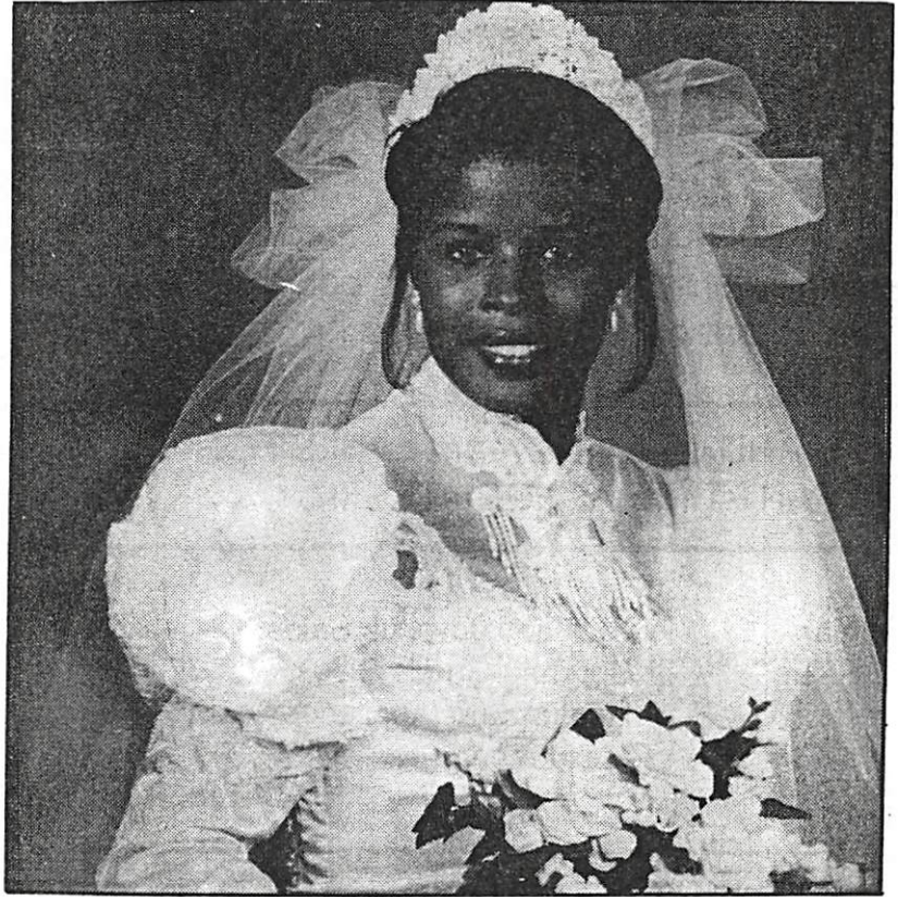
Sheleathaian Long Ray