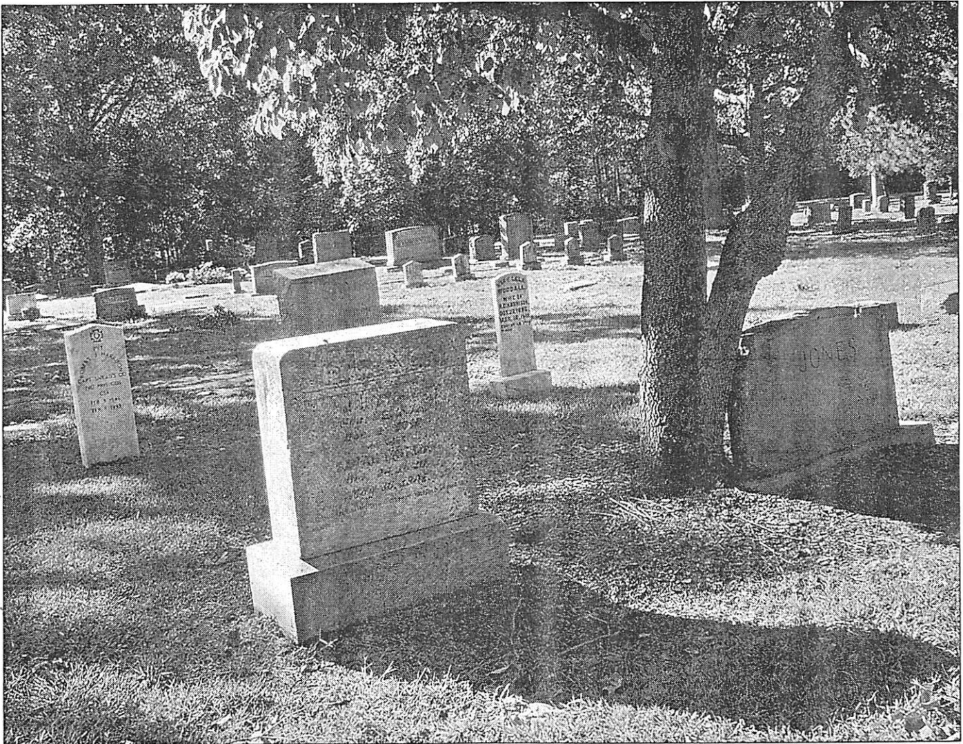
Cary's population has greatly increased in recent years, and eventually those new people will need a final resting place. Hill Crest Cemetery, above, is the only public cemetery in Cary now, and all its plots have been spoken for.

TOWN HAS EVERYTHING YOU NEED IN LIFE | AND AFTER