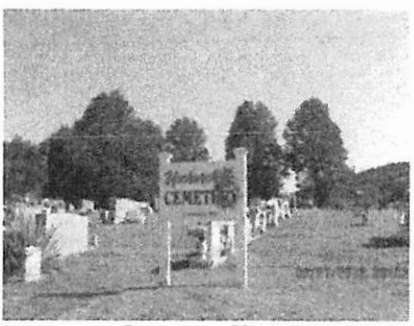
Cemetery Photo Added by: Theresa/Thunderbird584