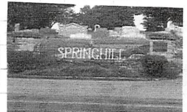
Cemetery Photo Added by: Anonymous