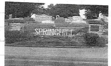
Cemetery