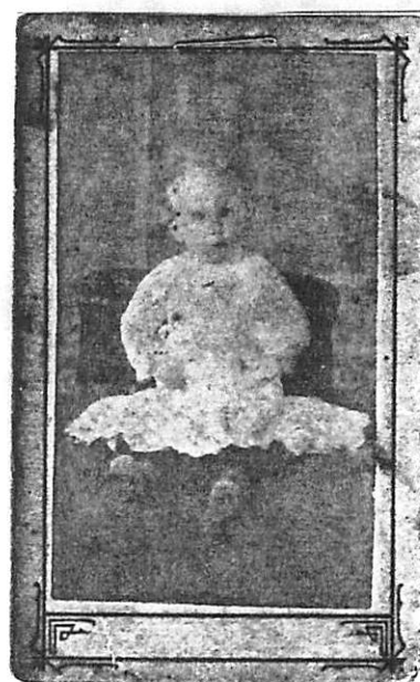
[D] ON BACK "IDA"