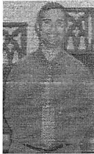
( http://greenlevel277.wordpress.com/2012/12/21/2012-officers-2/2013srwdnstan/ ) Stan Latta, Senior Warden, 2013