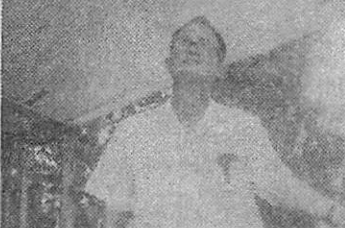
ANOTHER SHOWER IN BEDIAS