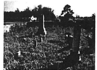
Click photo to enlarge

Blalock Cemetery is no longer in use, it sits on the side of the road and appears to be without any caretaker.