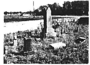
Click photo to enlarge

Directions from Raleigh, NC: From the south side of Raleigh take Beltline exit # 298, (Hwys. 401, 70 & 50). Stay on 401 South to Fuquay Varina. Turn left at the light at the intersection of 401 and Hwy. 55, and another quick left onto Hwy. 42. About 5 miles east on Hwy. 42, not far after crossing Old Stage Rd., is this small walled cemetery on the left. It is rather weedy but not seriously overgrown. Park by the side of the road.