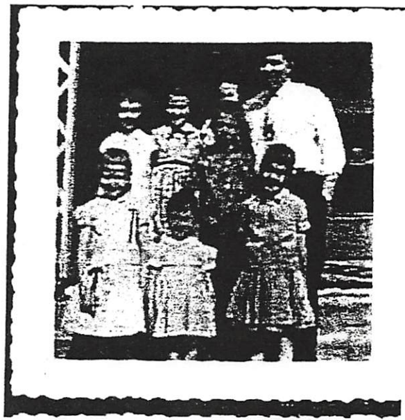
Upchurch Cousins about 1953