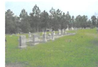
Click photo to enlarge

Directions from the intersection of Hwy. 70 south and Hwy. 50 (Benson Hwy.). Go north on Benson Hwy for 2/10 mi. to Garner Rd. Turn east-southeast (right) and go 8/10 mi. to the church and cemetery on the north side (left side) of the road.