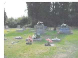
Click photo to enlarge

From Wake Co. land records: The property is owned by Hayes Chapel Christian Church and contains 3.14 acres total. The cemetery has 2.14 acres with room for more burials