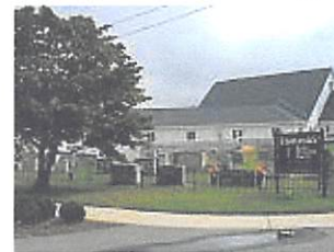
Click photo to enlarge