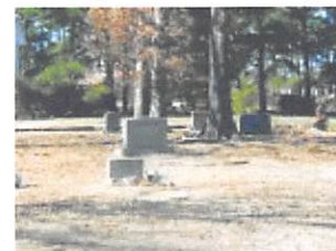
Click photo to enlarge