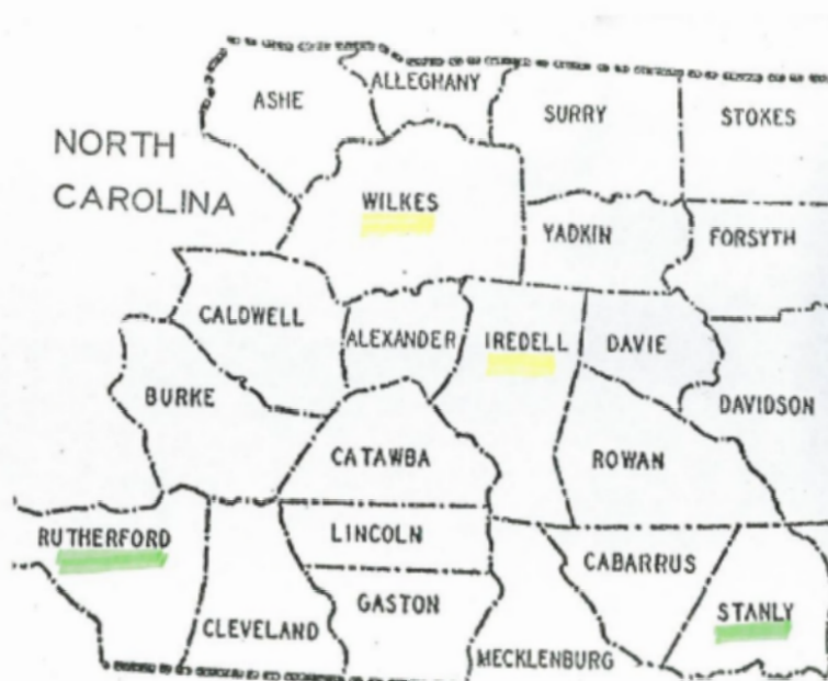
FIGURE 4 FOUR CLAN LOCATIONS IN CENTRAL/WESTERN NC