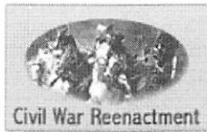
Civil War Reenactment

History of Kidder | History of Kingston | History of Mirabile | History of Nettleton | History of Polo